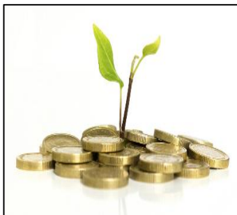
Dividend Capitalisation Method