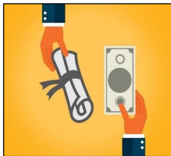
Buy-Back of shares