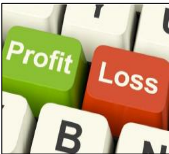
Profit and Loss