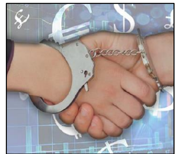
Prohibition of Insider Trading