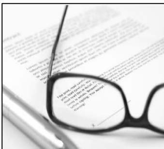
Landmark case the seeded the Corporate world