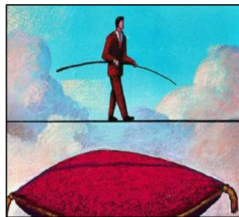
Forefiture of Shares