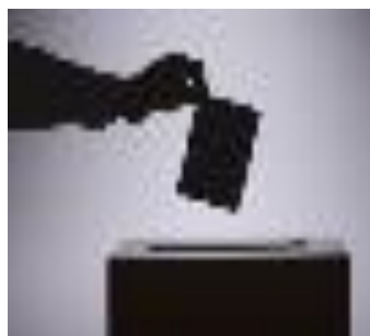
Plutocracy-one Share one Vote