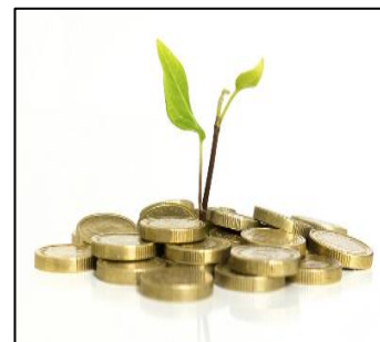
Valuing Loss Making Companies