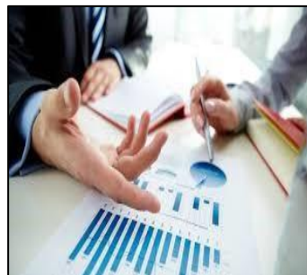
Management Discussion & Analysis